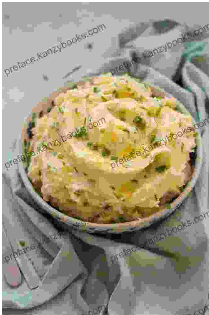
Creamy Mashed Potatoes

Roasted Brussels Sprouts, or Sautéed Green Beans with Almonds. For a touch of spice, try our Sweet Potato Casserole with Pecan Streusel. Our Cranberry Orange Relish and Homemade Gravy add the perfect finishing touches to your holiday feast.