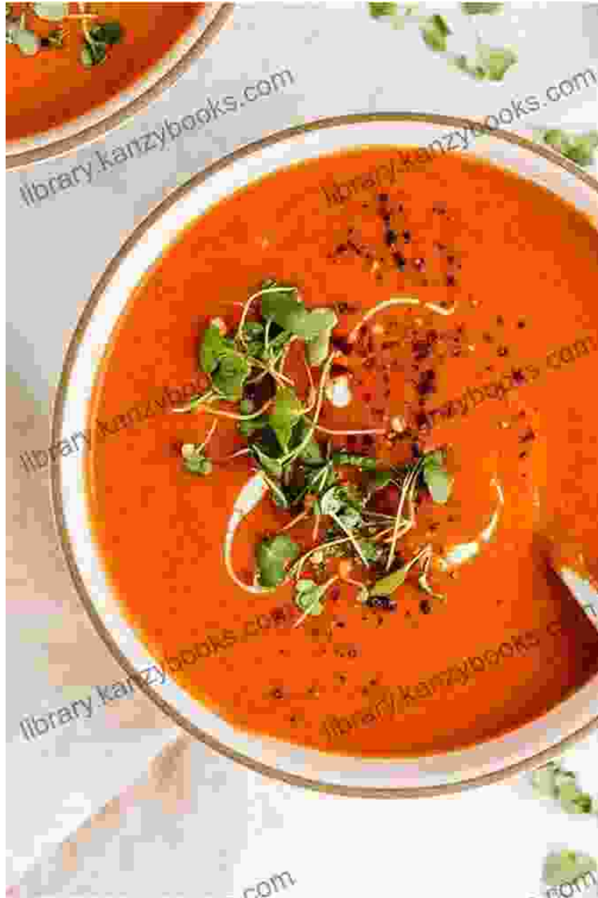
Creamy Tomato Soup with Roasted Red Peppers