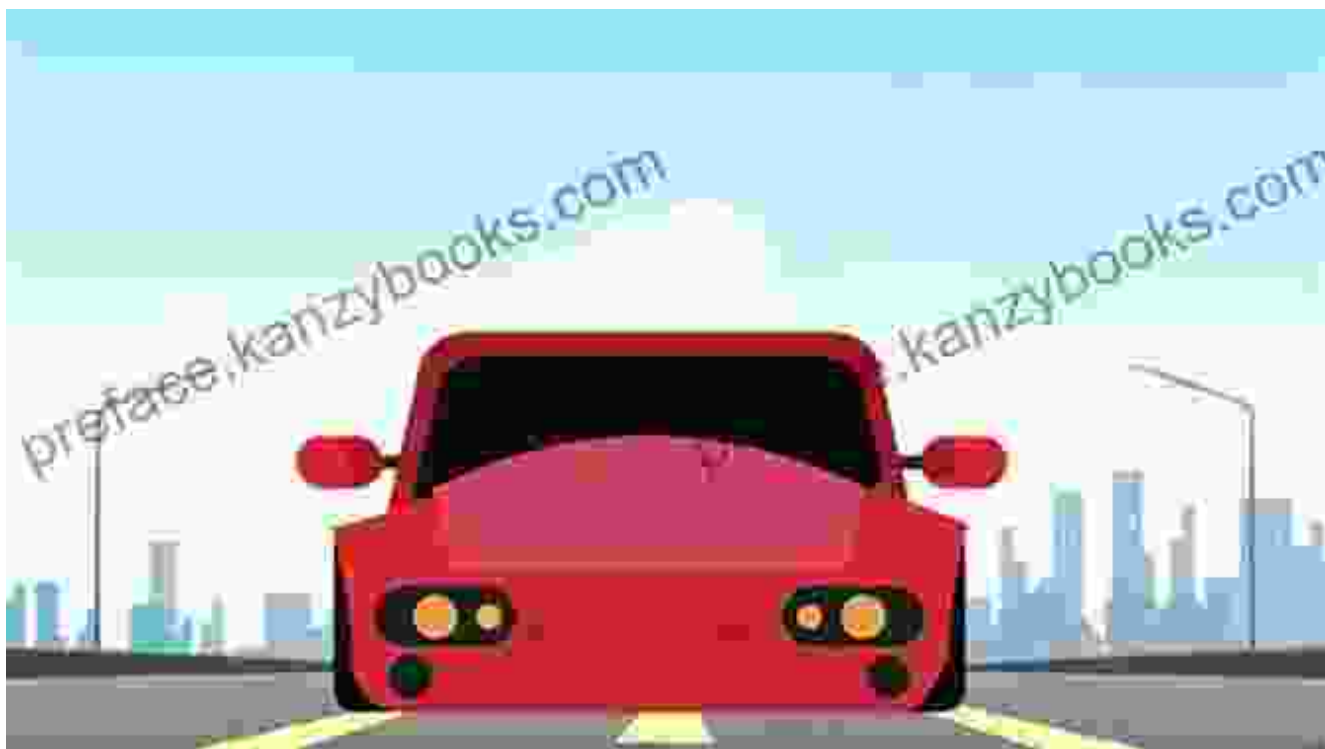
Figure 4: A 3D animation of a car driving created in Photoshop

In this chapter, you'll learn how to animate 3D objects in Photoshop. You'll learn how to create timelines, keyframes, and animations. You'll also learn how to use Photoshop's animation tools to create complex animations.