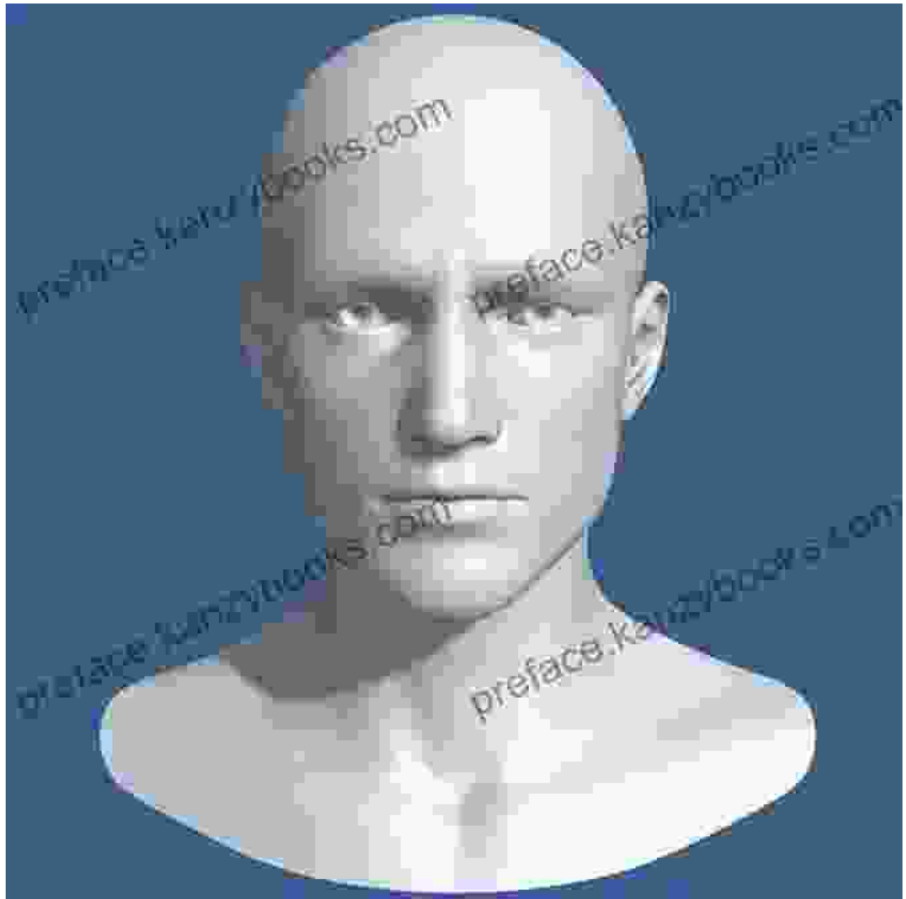
Figure 2: A 3D model of a human head created in Photoshop